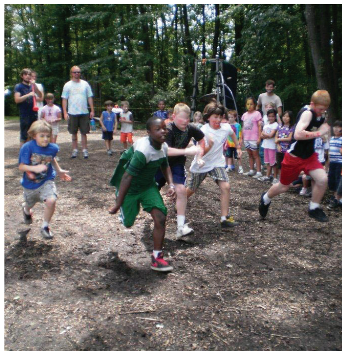
The race is on for another great Summer Camp for the school age children!